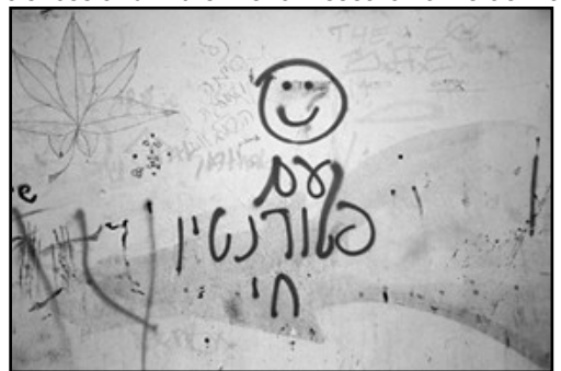
Fig. 4 - Graffiti "Am Florentin hair" - "the people of Florentin lives" Florentin 2008

It is one of my arguments that Florentin offers a great arena for capturing the processes taking place nowadays in the Israeli society through a detailed observation and analysis of gentrification, migration, urban activism and of the production of urban identities. The picture reproduced above (Fig. 4) summarizes most of what has been just said and it is one example of a graffiti you can find on many walls of Florentin. Working on globalization, no doubt it is a detail but I suggest taking it as an informative one. It reads "Am Florentin hai": "the people of Florentin lives" and is written in green and decorated with a