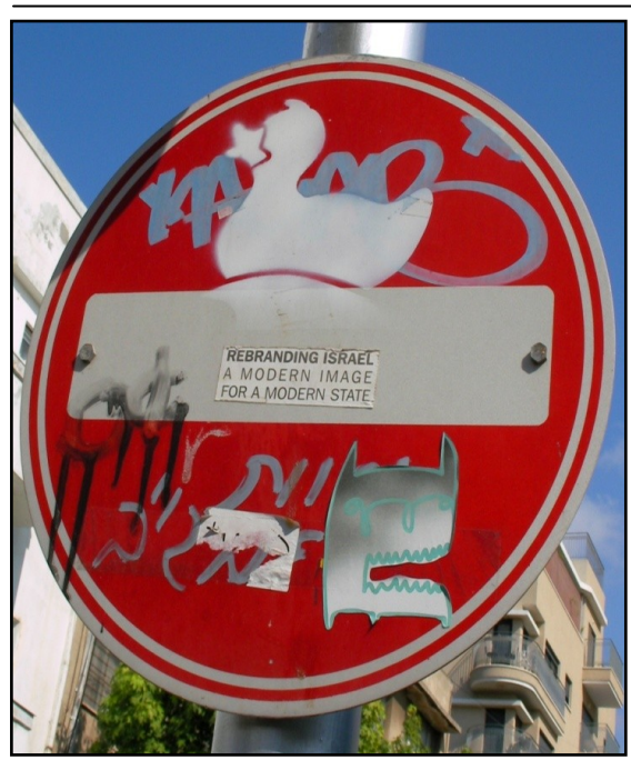
Fig. 6 - Sticker "Rebranding Israel. A modern image for a modern state", Florentin 2008. A call for putting together a new image for Israel from the streets of Florentin.