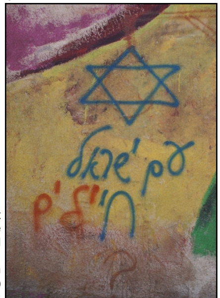
Fig.5 - Double graffiti and play on the words: "am Israel hai" – "am israel haialim" - "the people of Israel is alive" – "Israel is a people of soldiers" – Florentin 2008.

It is one of my arguments that Florentin offers a great arena for capturing the processes taking place nowadays in the Israeli society through a detailed observation and analysis of gentrification, migration, urban activism and of the production of urban identities. The picture reproduced above (Fig. 4) summarizes most of what has been just said and it is one example of a graffiti you can find on many walls of Florentin. Working on globalization, no doubt it is a detail but I suggest taking it as an informative one. It reads "Am Florentin hai": "the people of Florentin lives" and is written in green and decorated with a