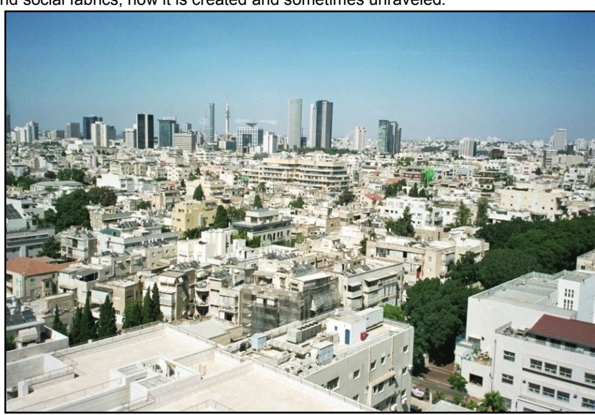
Fig. 1- Tel Aviv in 2008 with the business quarter and its high-rises in the background and the trees of Rotschild Boulevard on the right side of the picture

complex ensembles cities constitute today and it is a key to understand the constitution of the urban and social fabrics; how it is created and sometimes unraveled.